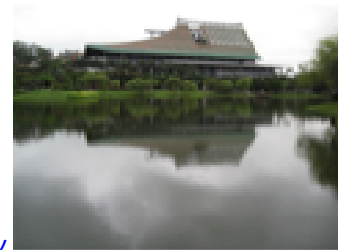
New conference centre of Xiamen University

The conference will be held at the International Conference Centre located on the sprawling scenic campus of Xiamen University. There are a number of excellent hotel facilities in this area. The university is located within 10min drive from the City Centre.